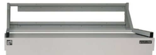
GTI's GLE (left) and GLL (right) series luminaires, shown with wall brackets, are available in 4 and 5 foot models. GLE luminaires have a front power switch and a power cord which plugs into a standard outlet. GLL luminaires must be hard wired into a switched power circuit. Both models are available with a wireless remote control.